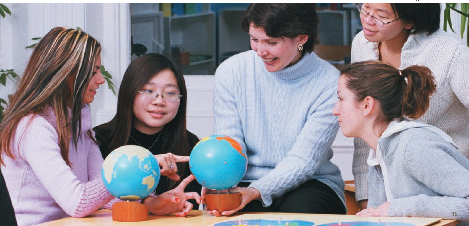
AMI teacher training