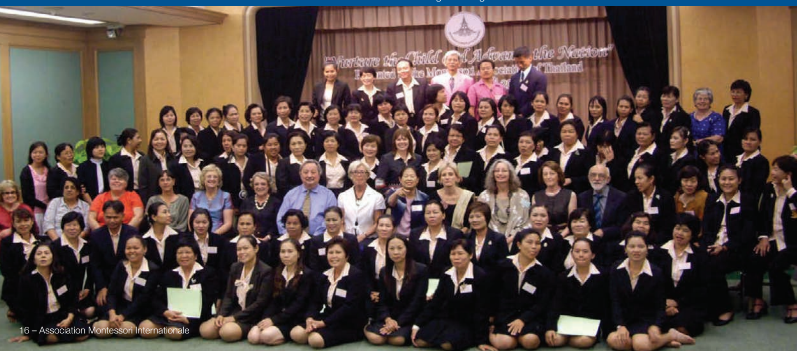
The graduating class of the 2nd AMI 3-6 Course held in Thailand