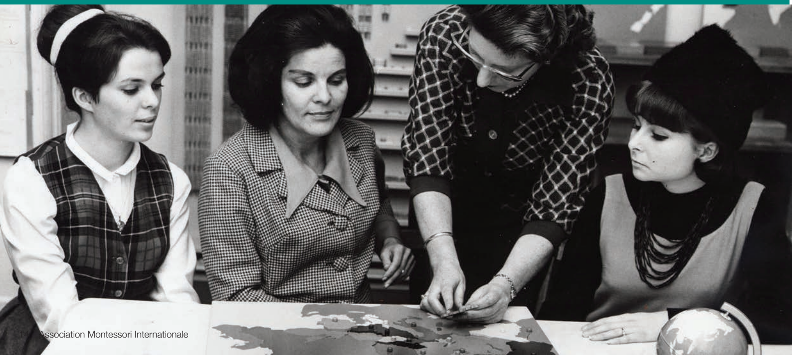
AMI teacher training (1960s)