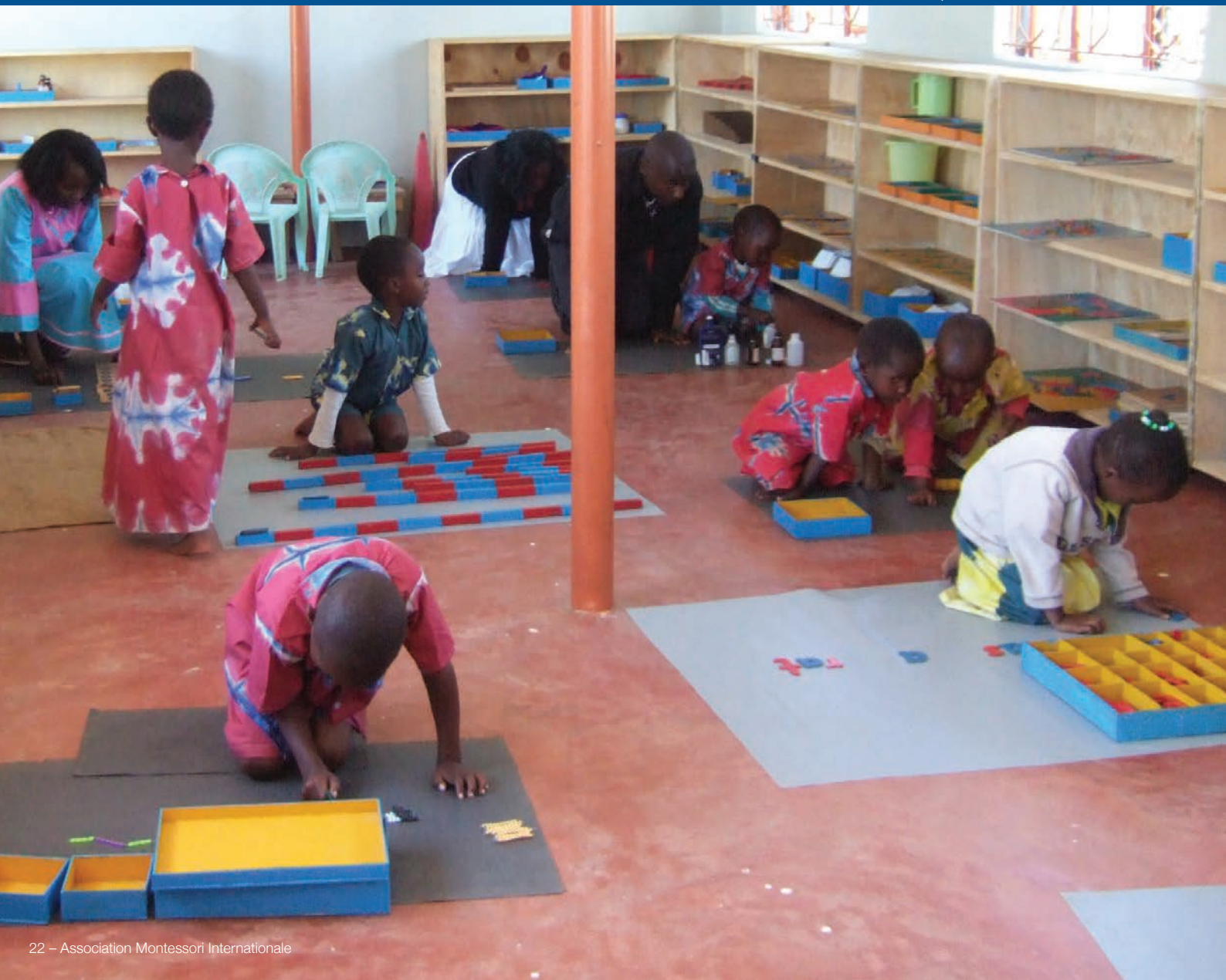
Children at the Corner of Hope Montessori School

A series of leaflets, booklets and DVDs have been created based on the Aid to Life initiative. These offer a useful resource for parents and anyone wishing to run parent support groups.